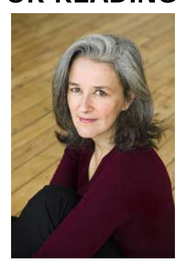
Tatiana de Rosnay