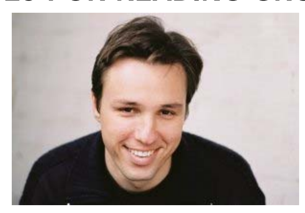
Markus Zusak THE MESSENGER